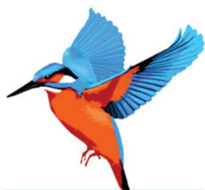
Sid Valley Biodiversity Group

The SVBG is very much about engaging with people about the delights of nature – and what we can do to enhance the Valley’s biodiversity.