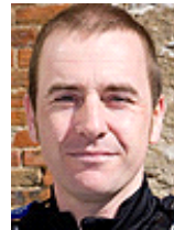
Pcso 30017 England